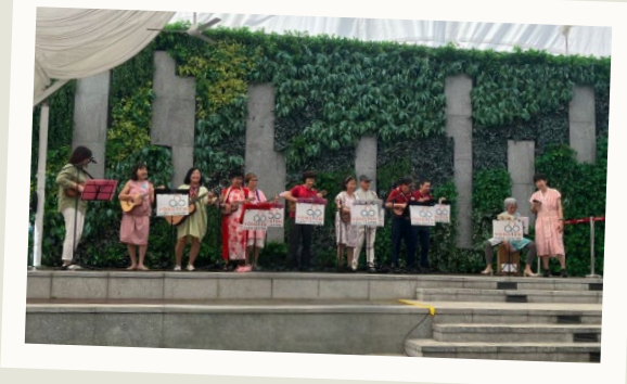
Promoting vitality and awareness on mental well-being