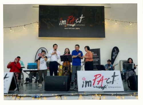
Spreading joy and hope through music