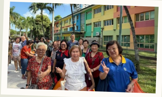
Festive shopping fun with beneficiaries