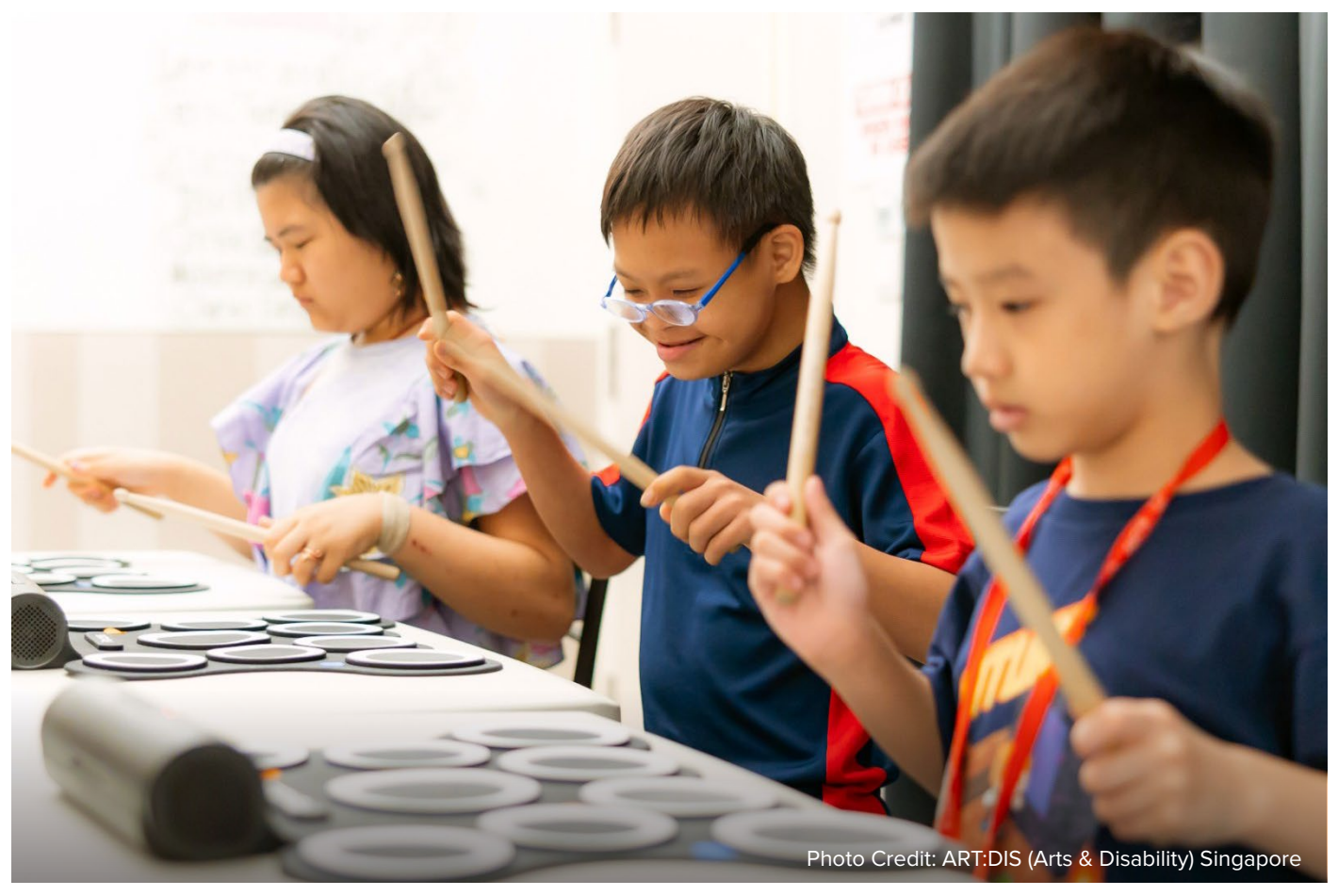
Electronic Drumming class under ART:DIS' Performing Arts Programme